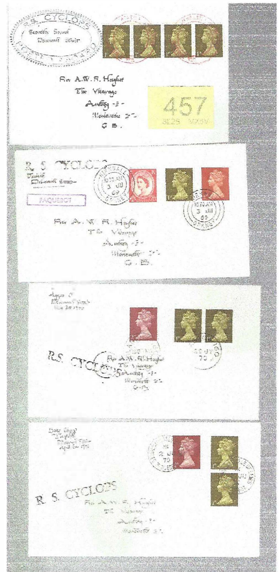
Lot ex 125

All enquiries to : auctioneer@postalhistory.org.uk