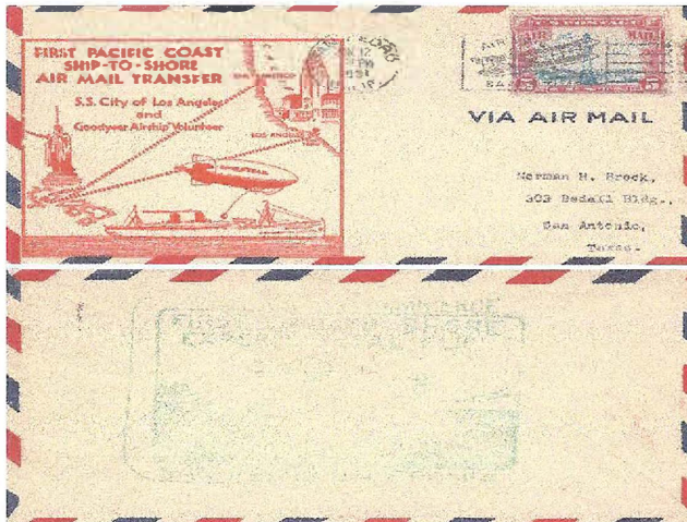
Lot ex 124

Annual Conference auction Saturday 19th September 2pm Holiday Inn 212 Abbey End Kenilworth CV8 1ED